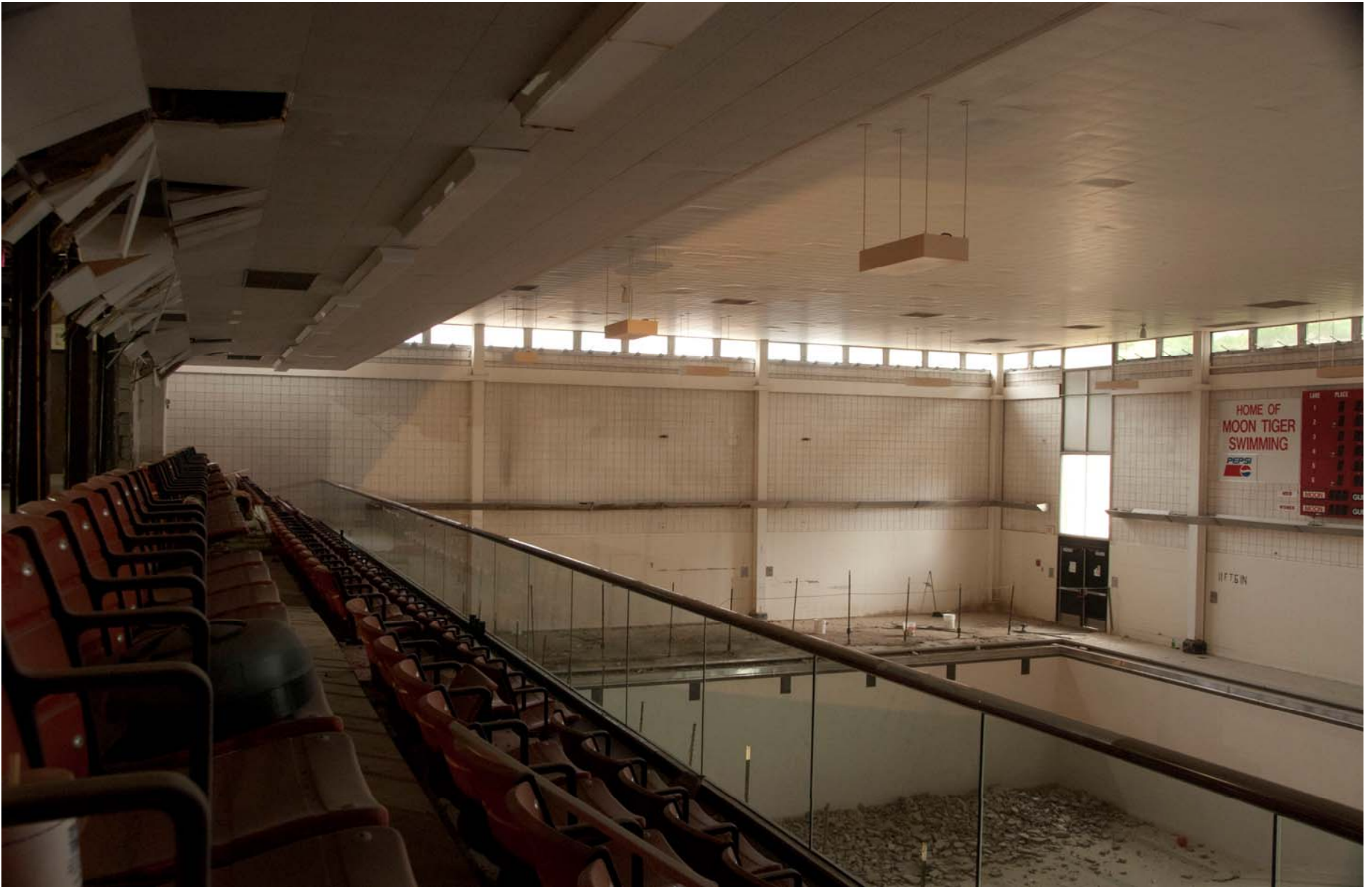
Swimming Pool Area